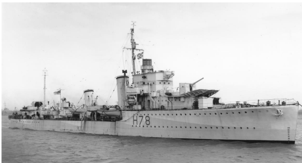
Picture: HMS Fame