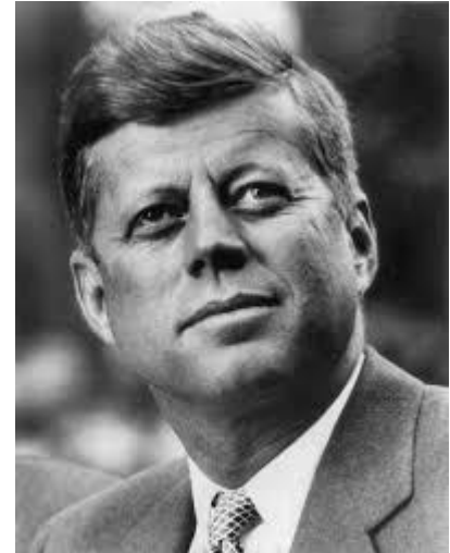
Picture: President John F. Kennedy

During two of the three November months of the South African War (1900 and 1901), five V.C.s were awarded, strangely none were awarded in 1899: