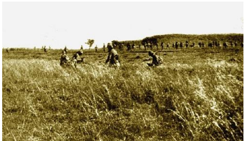
Picture: Landscape in the vicinity of the Battle of Karee Siding

March 1900 ended with the significant Battles of Karee Siding and Sanna’s Post – the former being a strategic railway supply station and the latter the water works that supplied water to Bloemfontein and surrounds.