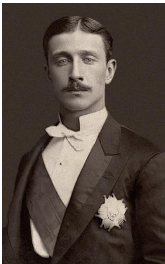
Prince Imperial Louis Napoleon

On 1 June 1879, 142 years ago, the Napoleonic dynasty came to an end with the death of the Prince Imperial in Natal during the Anglo-Zulu War. How did the French aristocrat get to be in a war between the British and the Zulus?