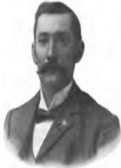
Picture: Jan Christoffel Greyling Kemp

He progressed rapidly through the ranks and in February 1901 was promoted to Combat General.