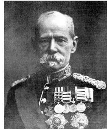
Picture: Lord Roberts

This was the beginning of the Scorched Earth Policy.