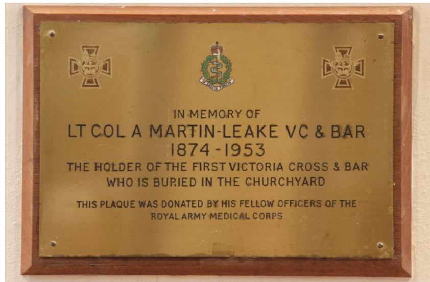
Picture: Memorial Plaque to Lt Col Martin-Leake V.C.

His will directed that his medals be given to the RAMC.