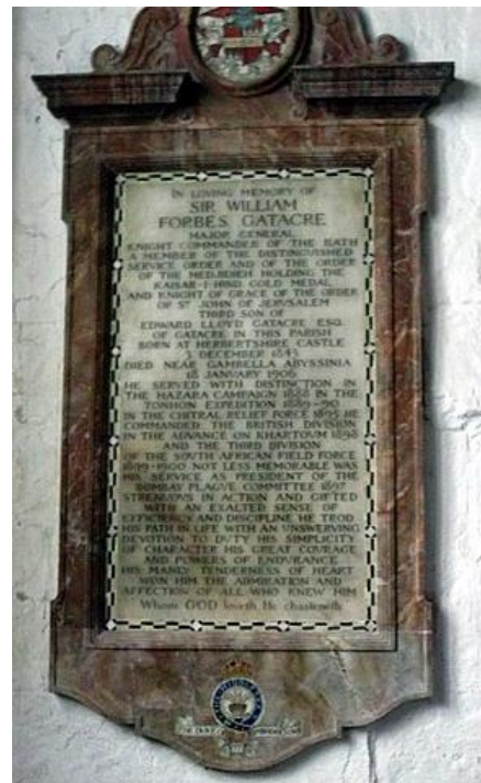
Memorial to William Forbes Gatacre – All Saints Church, Claverley, Shropshire

He died of a fever he had contracted in Ethiopia whilst on the expedition.