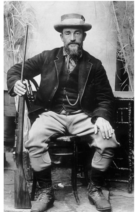
Picture: General Christiaan de Wet

Our commanders regularly overrun Khaki units, as the now legendary General de Wet recently accomplished again on Christmas Day in the Orange Free State – (Battle of Groenkop).