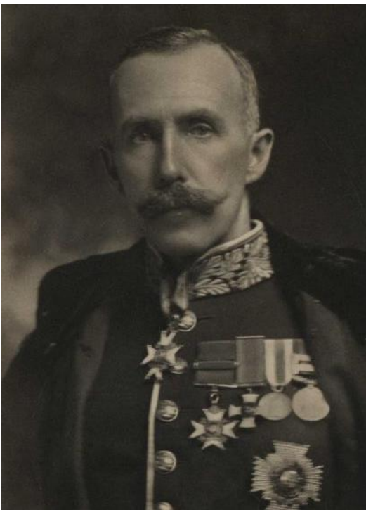
Picture: Lieutenant-General Gatacre

William Forbes Gatacre was born at the family owned castle (Herbertshire Castle), near Stirling, on 3 December 1843. After completing his schooling at the Royal Military College, Sandhurst, he enrolled with the 77 th Foot in 1862. Two years later he purchased the rank of Lieutenant. In 1870 he purchased the rank of Captain, just before the purchasing of commissions was abolished in the English Army. Between 1870 and 1873 he was at Staff College before spending four years at Sandhurst as an instructor.