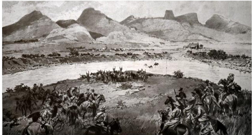
Picture : The Vaal River where Christiaan Beyers drowned

Government forces under the command of Louis Botha, his former Boer freedom fighter, chased Beyers and his followers for a number of days before Beyers was wounded and then, on 8 December 1914, he drowned in the Vaal River whilst trying to evade capture.