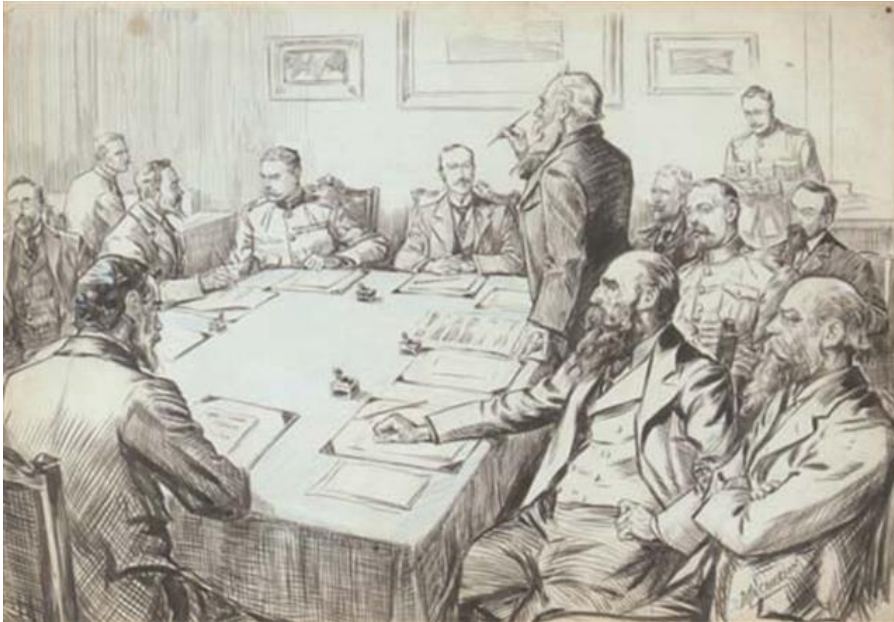
Picture: Discussions during the Treaty of Vereeniging

Because of ill health, he was unable to take an active part during the latter part of the war and at the conclusion of the war, he became a member of the Executive Council, taking part in the peace conference, and was one of the signatories of the Treaty of Vereeniging.