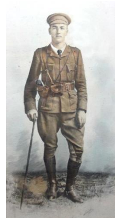
Picture: A Kaffrarian Rifles Officer at the Siege of Wepener

During the month of April, with Bloemfontein having been occupied by the British, the Free State capital was moved to Kroonstad.