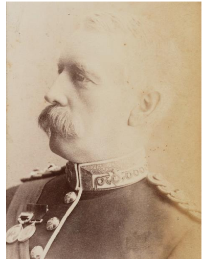
Picture: Brigadier-General Yule

At the Battle of Talana on 20 October 1899, the first set piece battle of the war, Penn-Symons was seriously wounded, and Yule took over command of the division and managed to drive the Boers from the hill at Talana. Yule immediately called for reinforcements from Ladysmith, which were denied by White, as he himself was waiting for the troops on their way from India, and Ladysmith was being threatened by Boers from the Transvaal and the Free State.