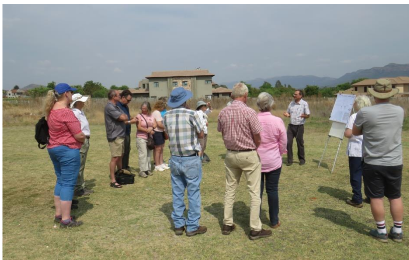
Picture: One of the 'discussion stops' along the route

We then made our way to the town of Magaliesburg and lunched at the local Wimpy. Certainly a different menu, but at least the service was 'more slick'.