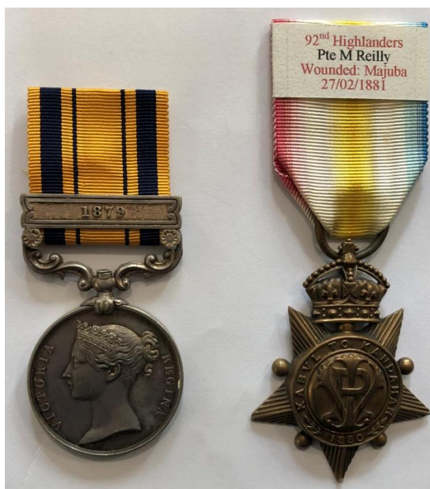
Conductor F Field was wounded and taken prisoner at the Battle of Majuba – from the bar on the medal one can see that he was present at the Anglo-Zulu War in 1879

The Battle of Majuba was fought on 27 February 1881 and the British suffered heavy losses, with 92 killed, 131 injured and 50 men taken prisoner. Major-General Colley was among the dead.