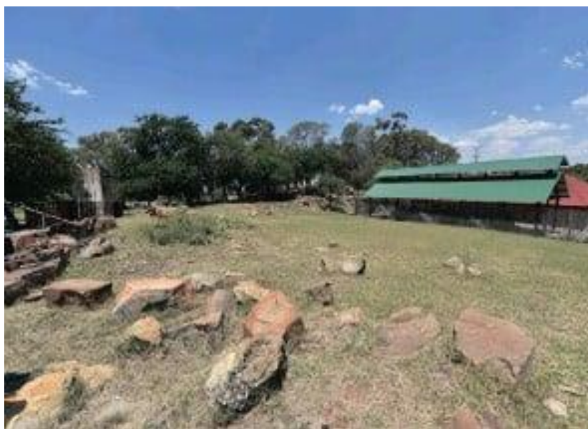
Picture: a ridge where Boer soldiers were stationed during the battle – the red roof on the far right is possibly the original 'red house'

In the book 'The First Boer War' by Joseph Lehmann, he records (page 198) – "Very early on the morning of February 12 th a strong column of 614 men (198 of them mounted) with three guns moved down the Heidelberg road, hoping to surprise the enemy. But again the Boers were ready for them. As the mounted volunteers rode up towards the summit of the hill with the red house, the Boers began to pick them off. Gildea rushed forward with the main column and guns in support. The Carbineers tried to take the stone cattle-kraal near the red house, but they soon discovered that it was fully occupied."