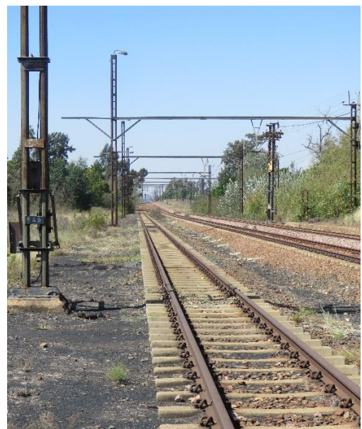
Picture: The location of the original Balmoral Station