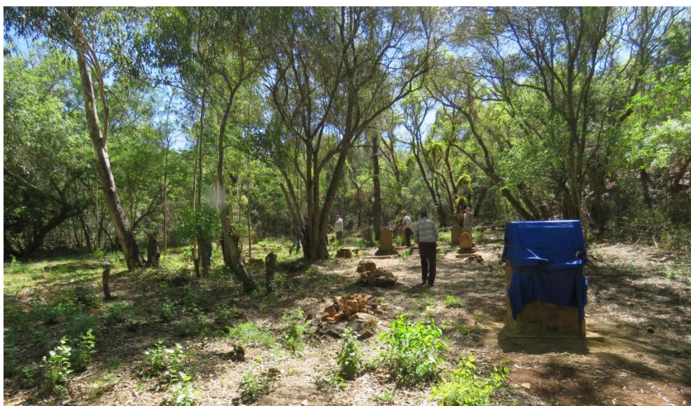
Bokkraal Cemetery showing the as yet unveiled memorial in the foreground

There is one Unknown Soldier buried at the Wonderfontein Cemetery.