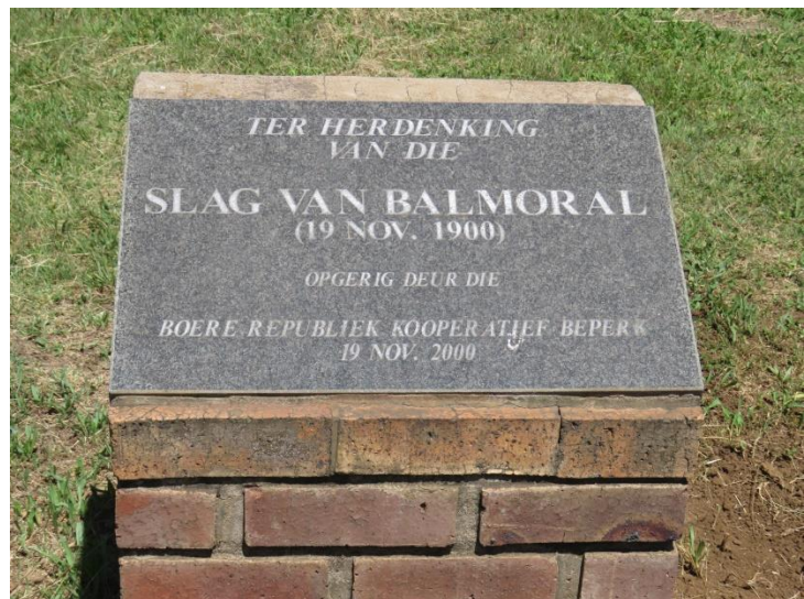
Picture: Memorial plaque to the Battle of Balmoral

If one was leaving Pretoria and visiting the battlefield of Diamond Hill, on one's way to the Battle of Bergendal, Balmoral, if there was a reason to stop there (because of activities during the South African War (1899-1902)), would be a winner.