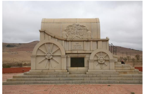
Picture: Monument at the Battle of Blood River

Before the battle, the Boers made a promise to God that if he rescued them out of the hands of the Zulus, they would honour that day as a Holy Day in remembrance of what God had done for them.