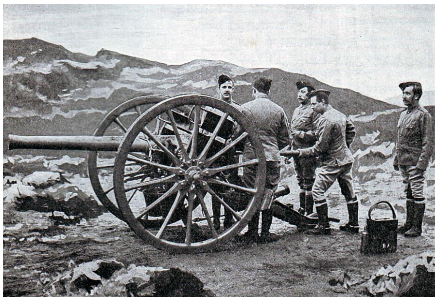
Picture: Part of the British Artillery used against the Boer forces

Just after midday on 19 December 1900 the Boers started their retreat and by mid-afternoon Generals de la Rey, Smuts and Beyers, with their commandos were in position at Maanhaar Rand. That afternoon it rained heavily and as Smuts' book records (page 161) – "The Boer officers did not see much advantage in fighting a purely defensive action against the enemy in this defensive position. It was therefore decided to fall back that night. When the enemy's scouts approached the position the next day they must have felt very happy in observing that the Boers had vacated the night before."