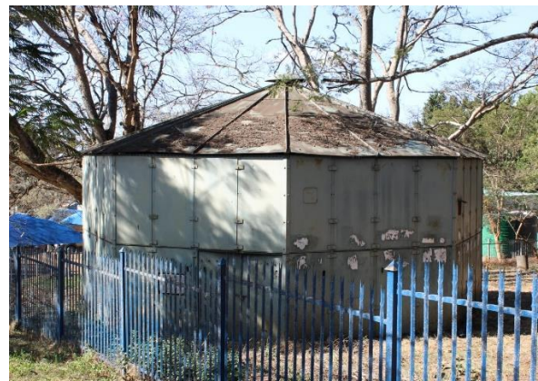
Picture: A 'moveable' Metal Fort