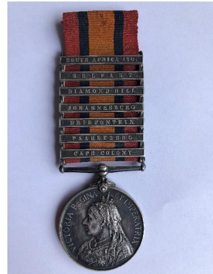
Picture: An example of a QSA issued to the British forces